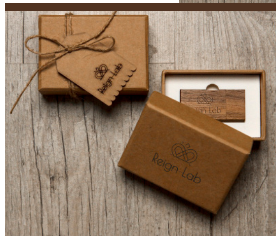
Kraft or White box

The type of boxes are divided into kraft boxes, casket boxes, wooden boxes, leather boxes, fabric boxes with plexiglass